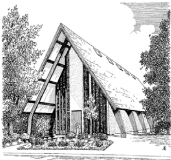
St. Peter's Lutheran Church San Leandro, California

Proceeds from the sale of these great looking note papers will help the women with the mission projects